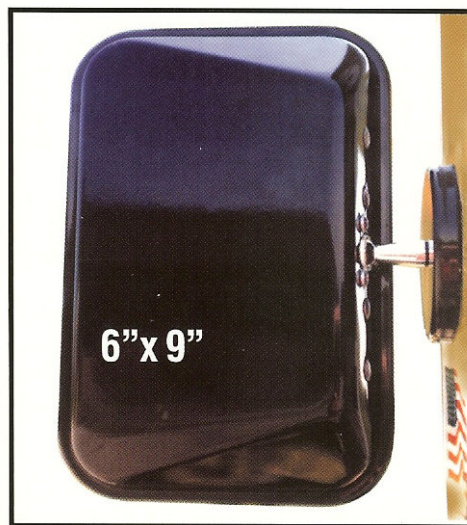
6" x 9"

Crystal clear convex mirrors with the correct "visual radius" for the job with ultra-strong ceramic magnet base, guaranteed to stay where it's put, on mast or safety cage, vibration-free, to eliminate blind spots and prevent back-up accidents!