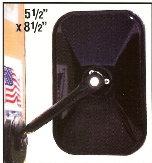
5 1/2" x 8 1/2"

Crystal clear convex mirrors with the correct "visual radius" for the job with ultra-strong ceramic magnet base, guaranteed to stay where it's put, on mast or safety cage, vibration-free, to eliminate blind spots and prevent back-up accidents!