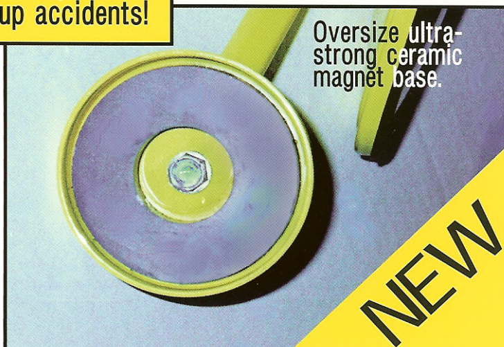
Oversize ultra- strong ceramic magnet base.