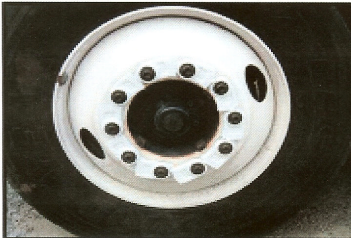
Blends with look of wheel